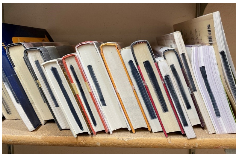
Withdrawn books headed for Sustainable Shelves

Some books, especially children's titles, bilingual books, and popular fiction, are used to stock Free Book Boxes around the county. With the Friends' blessing, the Library District has also provided withdrawn books to teachers to stock classroom libraries, and to the Cochise County Jail and the Douglas Prison Complex for use by inmates.