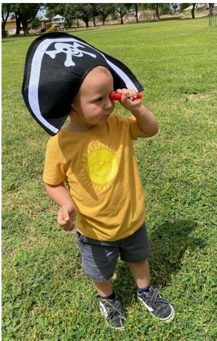
A little treasure hunter in Elfrida, summer 2022