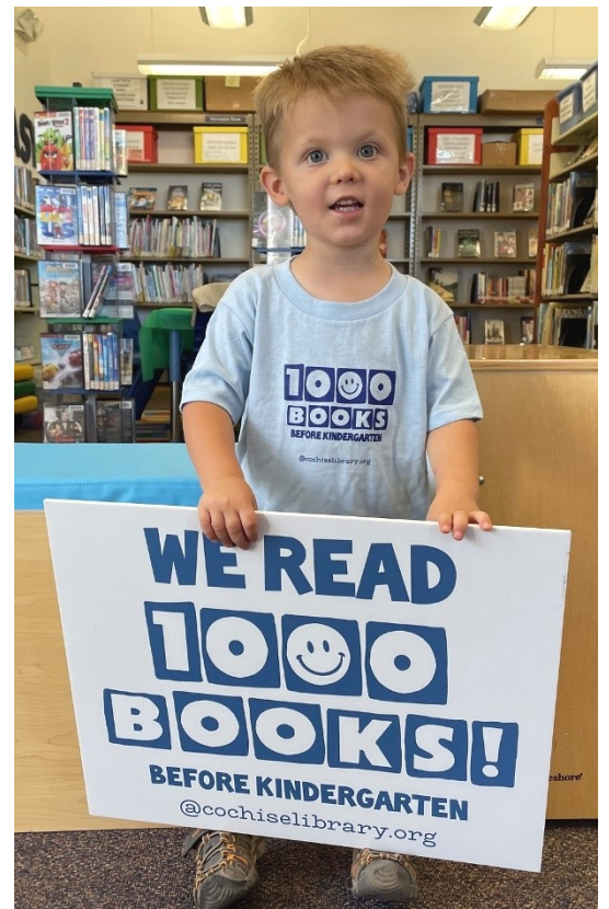
Celebrating 1,000 books in Elfrida

1,000 Books Before Kindergarten is a fun, flexible national reading challenge which encourages participants to read any books they like. All public libraries in Cochise County offer 1,000 Books Before Kindergarten. The program in Sierra Vista was established several years ago and operates independently, but as of July children completing the 1,000 Books program in Sierra Vista are also eligible to receive a t-shirt or tote bag courtesy of the Friends of the Library District. Thank you, Friends!