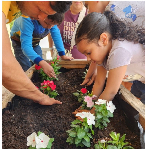
Summer readers planting flowers in Bowie (above) ; Lego builders in Elfrida (left)

One highlight for kids and families was the selection of free children’s books provided by the Friends. Roughly 300 books were distributed as part of this year’s program.